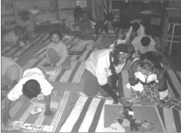
Children with a teacher in the Montesori class

years outside of Addis and to organise the transport. Our two teachers had a hard but fruitful time and they came back with a big box of teaching material and a lot of new knowledge. When they started to work with the children we were all happy to see the progress in pedagogical work. As we got again the chance to send teachers we did it immediately.