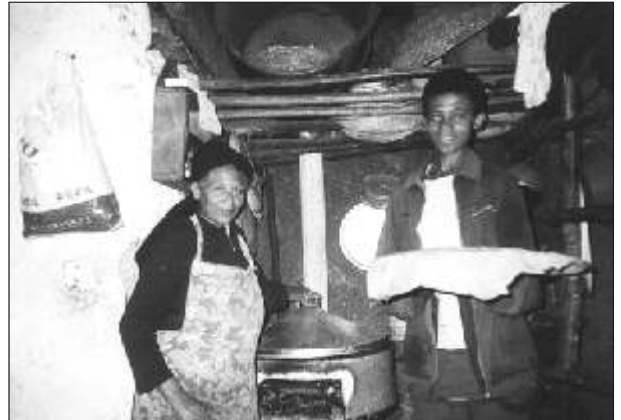
Rehabilitation of our Trainees: Prepare and selling ingera