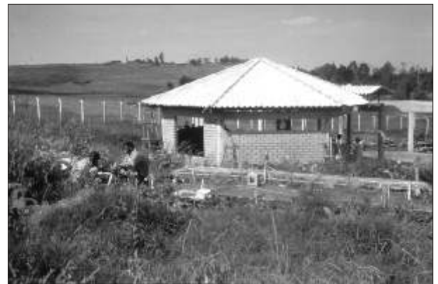
Building the classrooms in Mekaissa