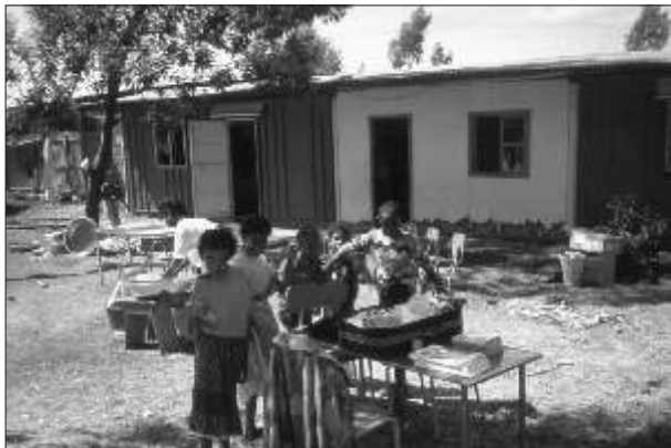
Cleaning day in Kazanchis

When I arrived in July 1993 the school was closed, no teachers around, only once we met for a coffee and then all disappeared for Nazareth. I had time to realize that I am in Addis, to learn Amharic (better to try to learn the language), to look for a house, a mamita, a zabana and to arrange me with the traffic in Addis – that time very different from today.