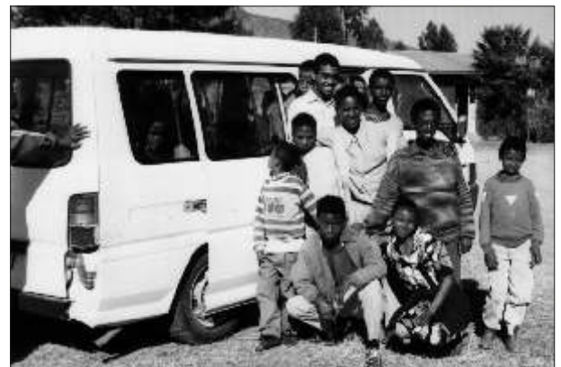
How many children fit in one minibus?

After having decided about windows, floors, colours, after having changed the toilets from inside the houses to outside, after having asked to build a kitchen, which was not in the plan and having asked for additional money to build ways and steps around the houses, after