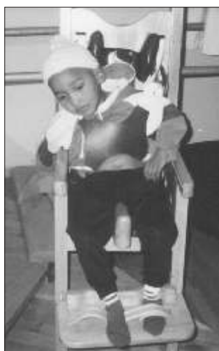
The work to provide special chairs for children started.

him and later she organised a radio for him so that he had some highlight in his hard life.