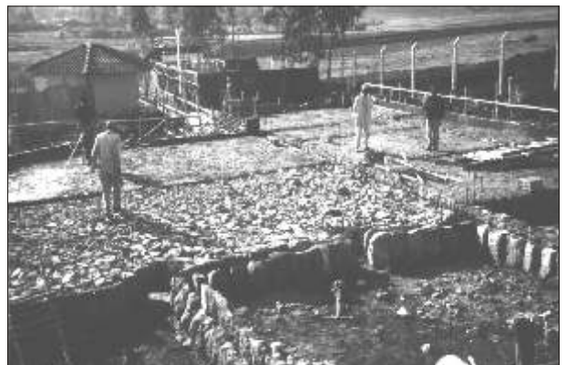
Building the new workshop and kitchen

With the new program came the need for more rooms and places for the youngsters to work. We were