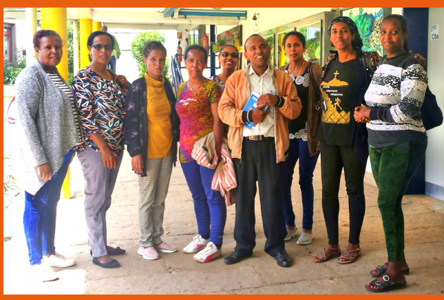
CMCC staff in Addis Ababa

Donations are tax deductible. Receipts will be issued for amounts above 50 \\ightharpoonup after the end of a calendar year. The Association for Disabled Aid for Ethiopia is committed that the money is only to be used for statutory purposes: »The ideal and financial Support for the Center for Mentally challenged Children and Youth in Addis Ababa in Ethiopia.«