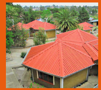
The CMCC school areas in Addis Ababa

Contribution from 15 €/year Kreissparkasse Tübingen IBAN: DE49 6415 0020 0001 5845 32 BIC: SOLADES1TUB